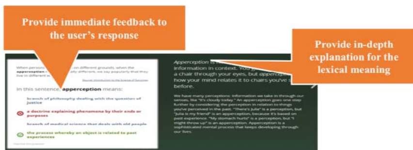
Figure 1. A screenshot of responses provided by Vocabulary.com.

Immediately after the user selects a response to a question, Vocabulary.com gives feedback (see Figure 1). Using the feedback, users can see the correct response for the question as well as the lexical meaning by reading the in-depth explanation of the word.