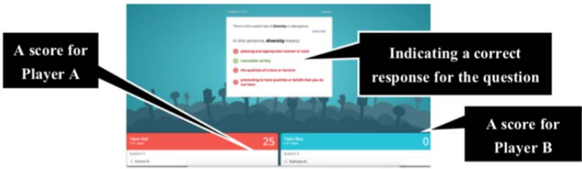
Figure 3. A screenshot of “Vocabulary Jam”.