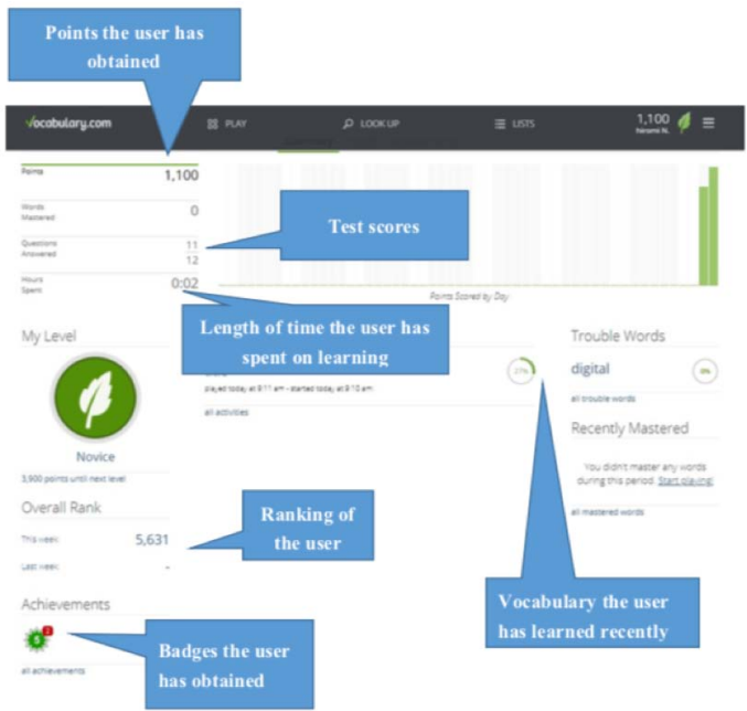
Figure 4. A screenshot of “My Progress”.

identifying the correct response to the question; and (2) understanding the lexical meaning of words by reading the descriptions. Vocabulary.com could enhance the efficiency of vocabulary learning on the platform by adopting functions to promote active vocabulary use such as uploading short sentences the user has constructed and by offering feedback from native speakers. Interactions with native speakers not only informs users of appropriate expressions for erroneous attempts but also motivates them to learn the target language (e.g., Cho, 2015).